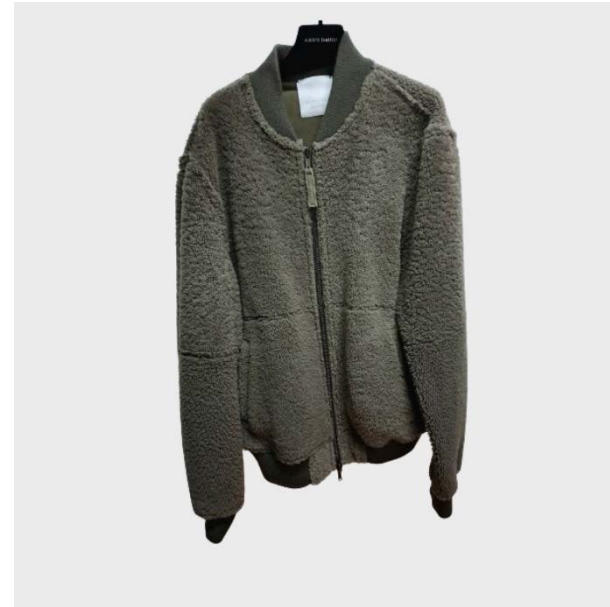
BOMBER ML IN SHEARLING SALVIA