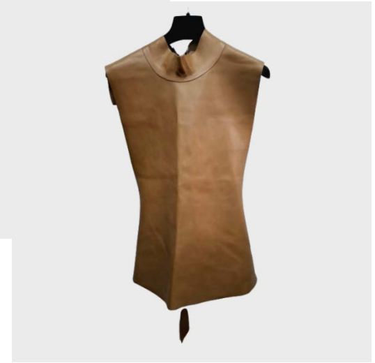
VARIANTE: APRON TOP SM IN PELLE BEIGE