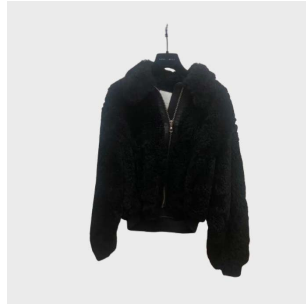
GIACCA ML CON ZIP IN PELLICCIA NERO