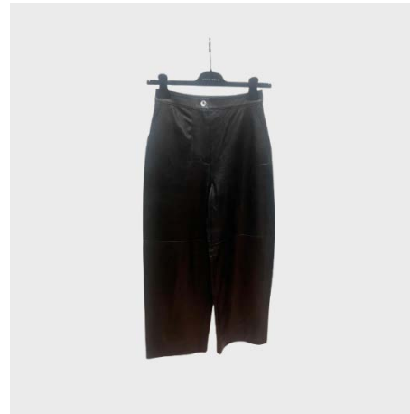
PANTALONE AMPIO IN PELLE LUCIDA NERO