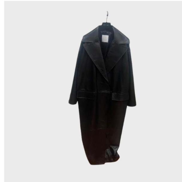
CAPPOTTO ML LUNGO IN PELLE NERO