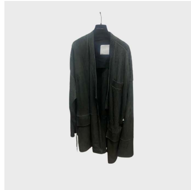
GIACCA KIMONO ML IN PELLE FILI FLOTTANTI GRIGIO