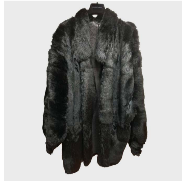
PELLICCIA ML OVER NERO