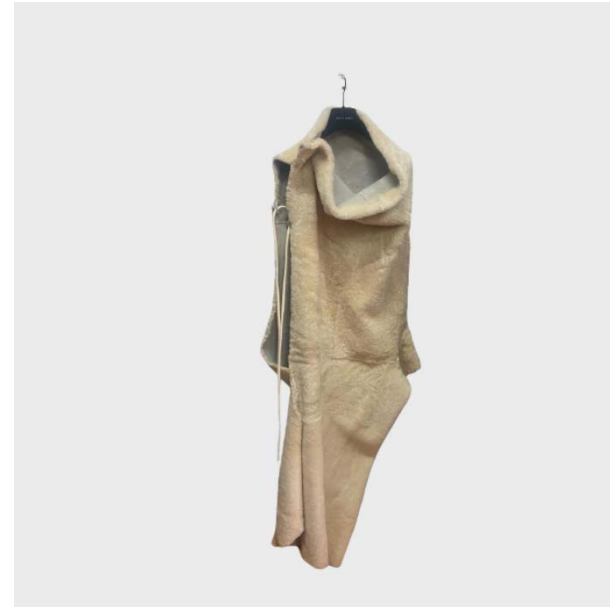
DRESS CAPPA MONOMANICA IN PELLICCIA BIANCO