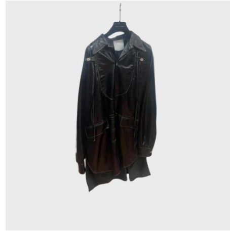
TRENCH ML IN PELLE LUCIDA NERO