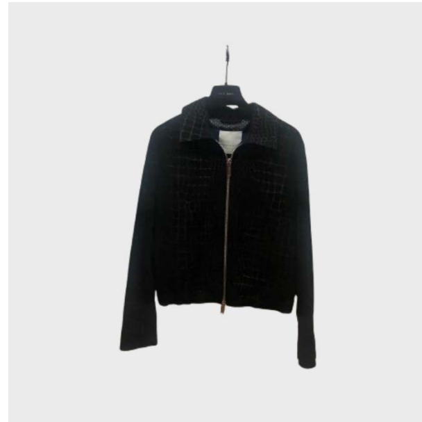
DRESS TUNICA CON SCOLLO DT IN LANA GRIGIO